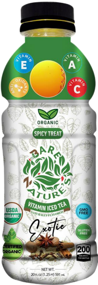
20 FL OZ (591 mL) Bottle