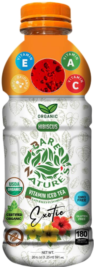
20 FL OZ (591 mL) Bottle